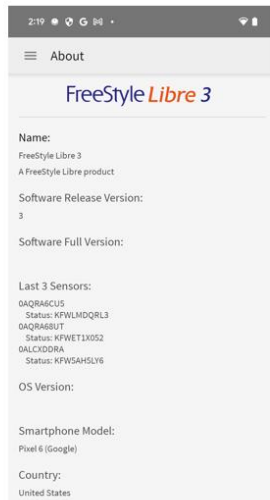
In the App, from the Main Menu select About Screen

If you are wearing a Sensor, you can find the Serial number in the App or Reader. The Serial Number can also be found on the bottom of the Sensor Applicator label and carton.